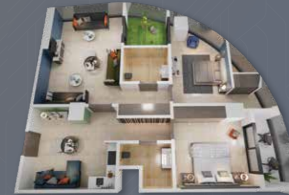
2 BED APARTMENT (1171 Sq Ft - 1528 Sq Ft)