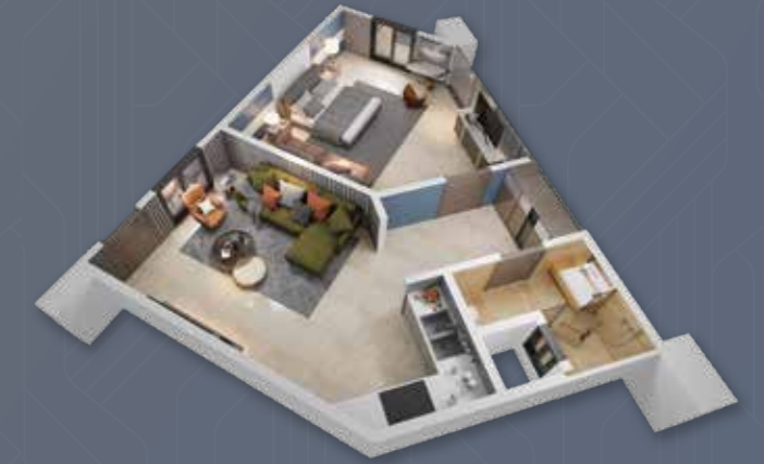
1 BED APARTMENT (B) (438 Sq Ft - 763 Sq Ft)