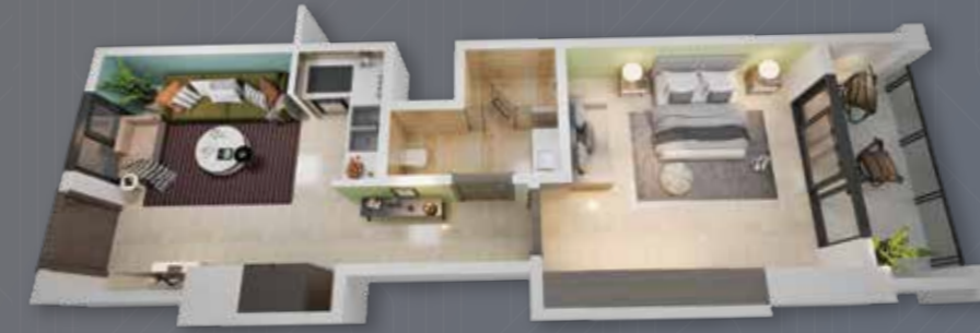
1 BED APARTMENT (A) (600 Sq Ft - 1336 Sq Ft)